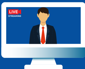
Live streaming product pitches