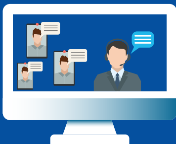
Video & audio call via match & meet platform