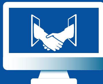
Smart business matching