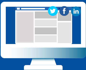
Product highlight on social media channels