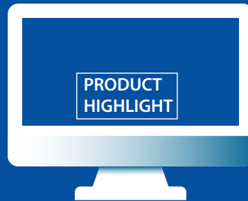
Product highlight on website